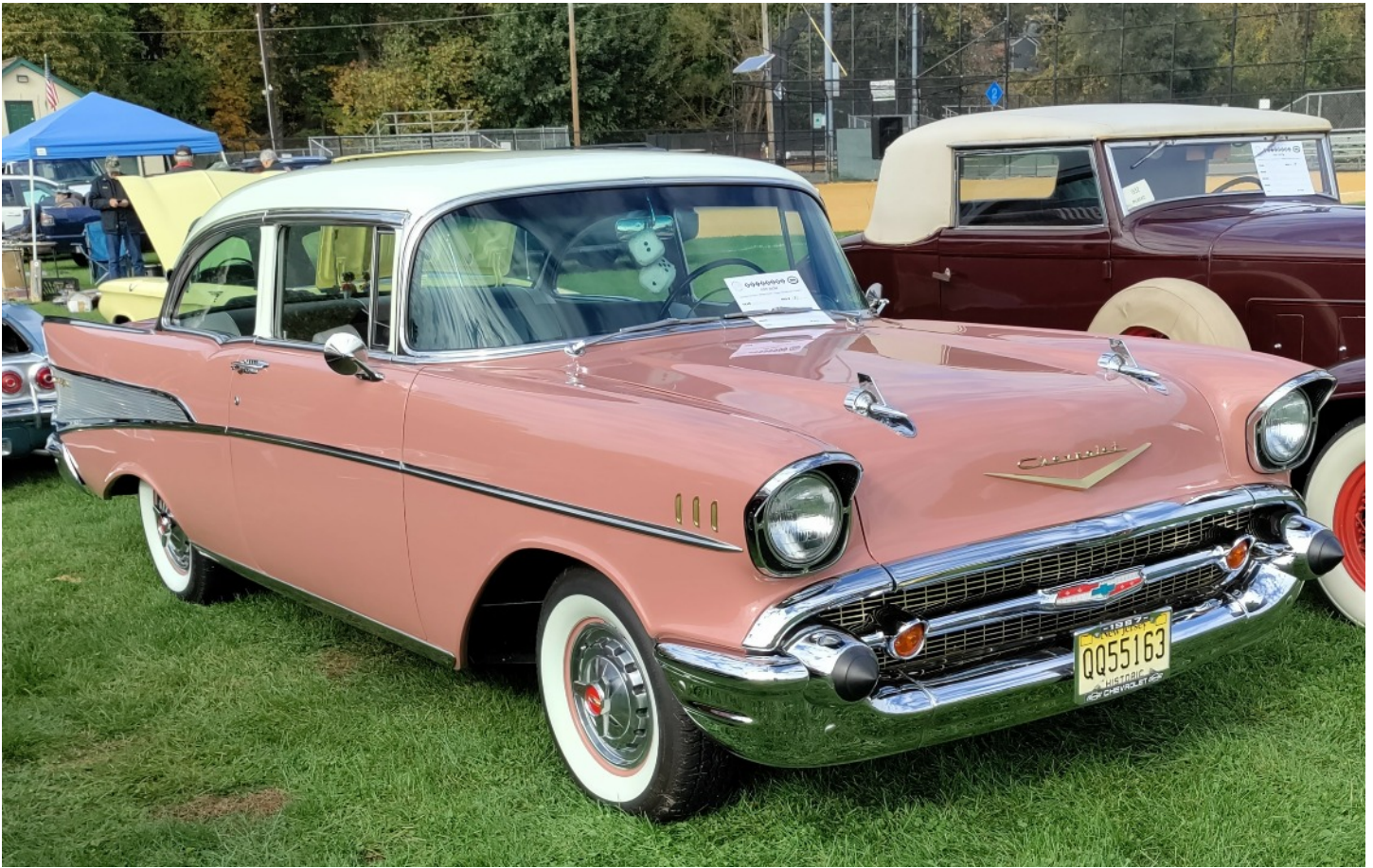
1957 Bel Air two-door sedan