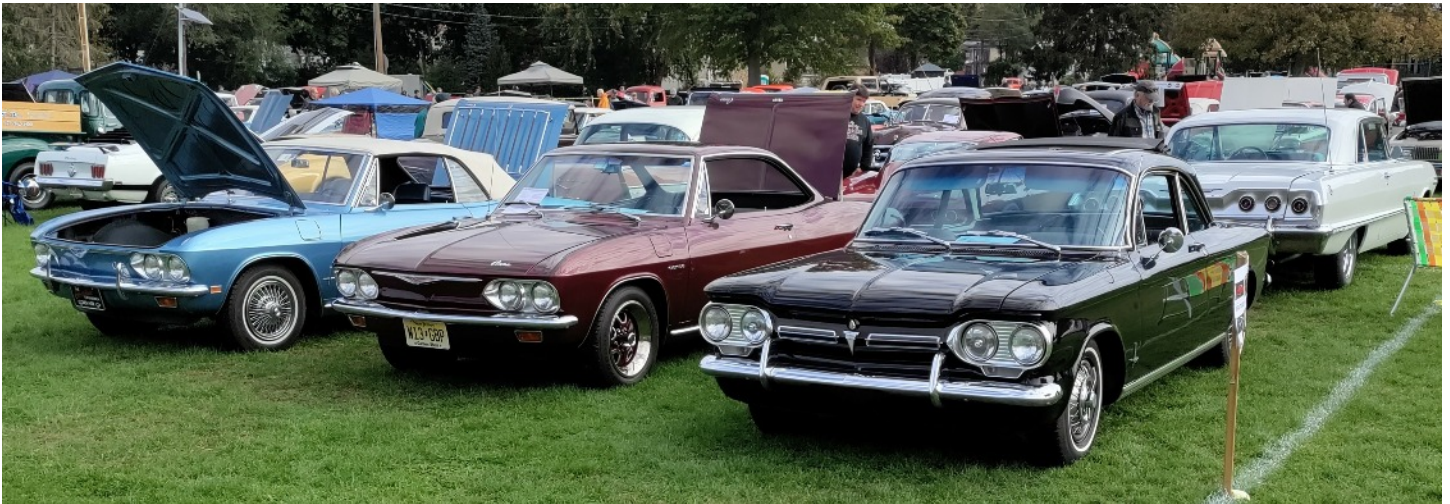
Three Corvairs in a row, with a 1963 Impala behind the 1962 Monza coupe.