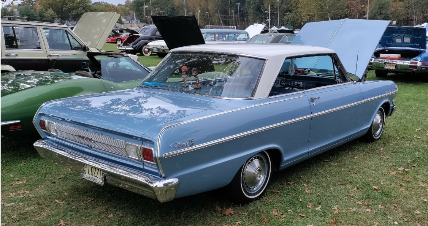
1965 Nova Sport Coupe.