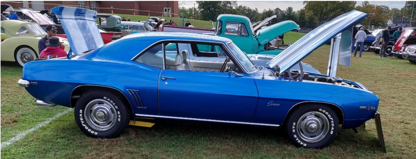
1969 Camaro Z/28 coupe.