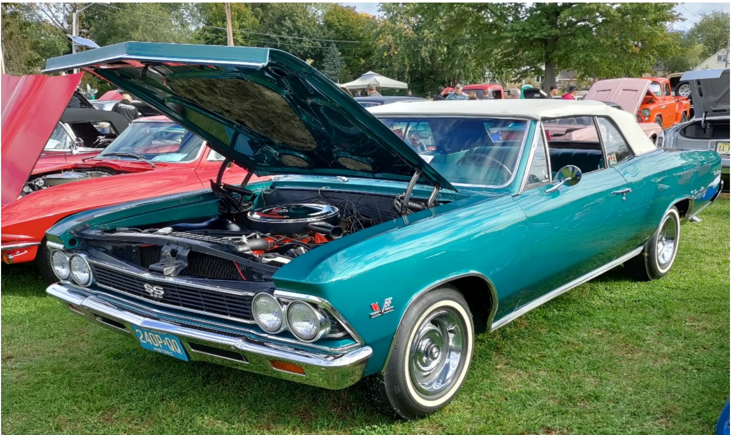
1966 Chevelle Super Sport Convertible