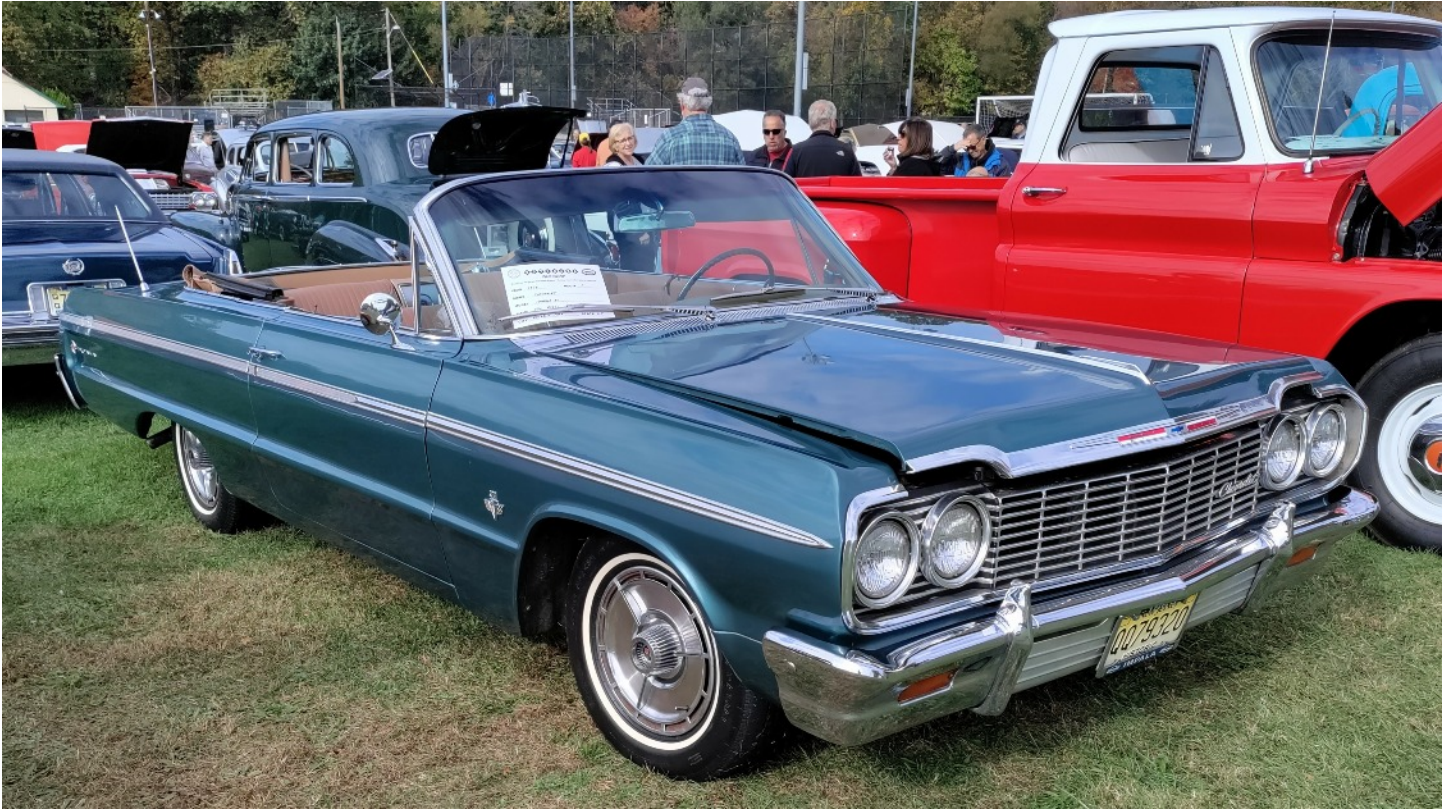
1964 Impala Super Sport convertible with a 409.