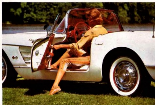
The Corvette's roll-up windows are easy to operate—a convenience not found on some other sports cars. Power-operated* windows are also available for those who desire an extra measure of comfort.

This is what an American sports car must be. Versatile. Capable. Luxurious. The Corvette by Chevrolet is ideal for people who want a special fun-for-two kind of driving.